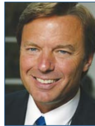
Senator John Edwards 2004 Democratic Vice-Presidential Candidate Former Senator from North Carolina

H.E. assumed the position of Chancellor of the UAE University since its inception in 1976. He served as the first UAE Minister of Higher Education and Scientific Research upon establishment of the Ministry in 1990, then as the UAE Minister of Education after merger of the two education-related ministries (Education and Higher Education & Scientific Research) in November 2004.