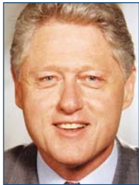
The Honorable William Jefferson Clinton 42nd President of the United States

William Clinton was elected President of the United States in 1992, and again in 1996 - the first Democratic President to be awarded a second term in six decades. President Clinton's core values of building community, creating opportunity, and demanding responsibility resulted in unprecedented progress for America.