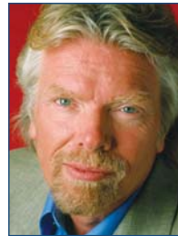
Sir Richard Branson CEO of the Virgin Group

William Clinton was elected President of the United States in 1992, and again in 1996 - the first Democratic President to be awarded a second term in six decades. President Clinton's core values of building community, creating opportunity, and demanding responsibility resulted in unprecedented progress for America.