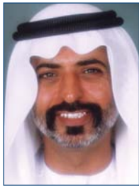
H.E. Sheikh Nahayan Bin Mubarak Al Nahayan Minister of Education and Scientific Research, and Chancellor, Higher Colleges of Technology

Sir Richard Branson is a flamboyant British billionaire who has built his company (Virgin) into one of the world's biggest brands. He's brash and isn't afraid to take risks. While at Stowe - the famous English public school - he started a student advisory service. Three years later, he founded the Virgin mail order record company. In 1984, Branson established, Virgin Atlantic Airways.