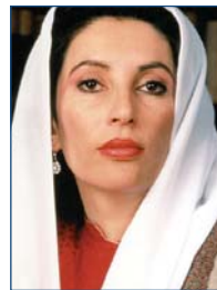
Prime Minister Benazir Bhutto Twice-Elected Prime Minister of Pakistan and First Female Prime Minister of Pakistan